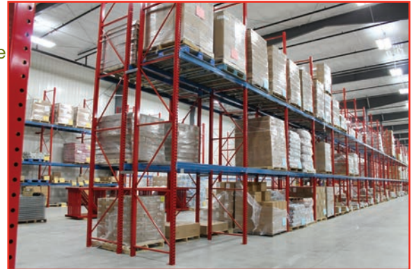
New racking in expanded warehouse space

What has really made our journey over the past year amazing are the people who are part of it. We are blessed with wonderful staff, fantastic agency partners, generous donors and incredible volunteers – over 2,300 this past fiscal year – who walk with us on this journey. But the really special part of this journey are our clients...the little boy whose eyes lit up when his mom handed him a fresh apple to eat that she had just received in our food shelf. Or the senior who wiped away tears as a volunteer helped her load her cart with enough food to fill her pantry. Or the single father who was able to take a deep breath and stand up tall, knowing he now had enough food to feed his two kids until his next payday. Those individuals are the key to our journey. We are grateful to them for the trust they place in us, and we are grateful to you for providing the resources necessary to fulfill that trust.